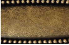
002 CUERO PLB